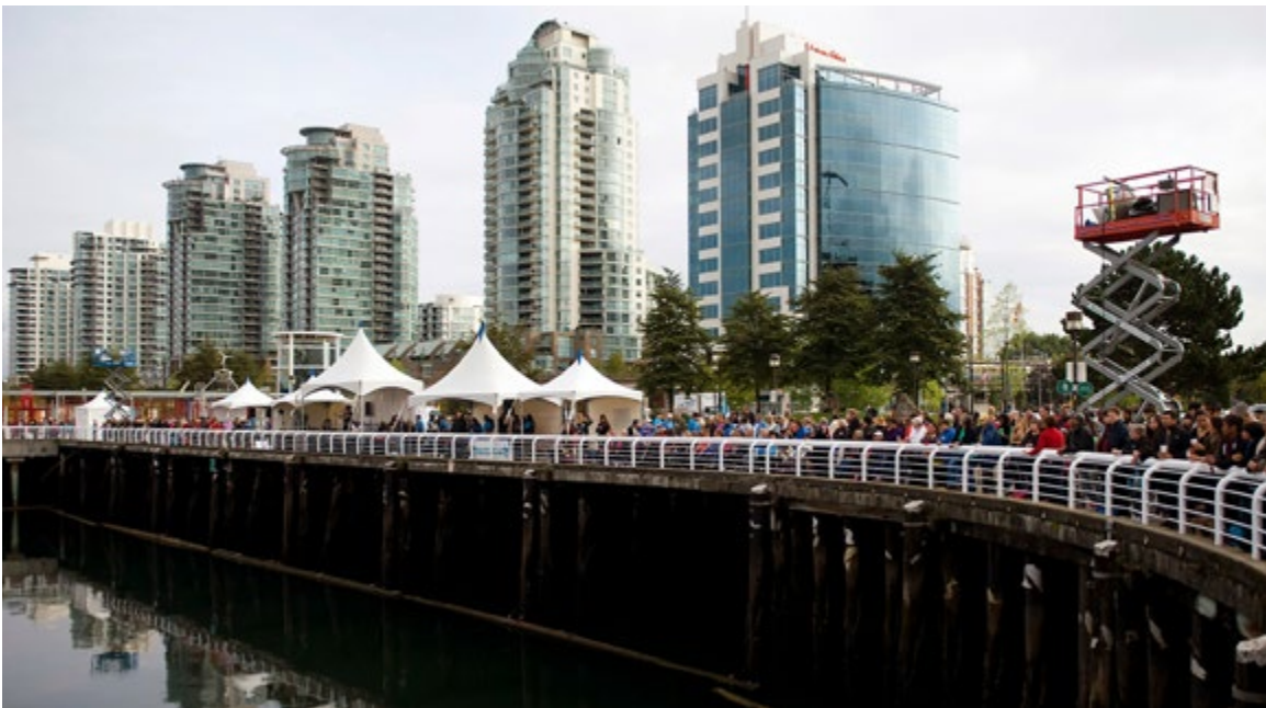
Crowd at False Creek for the All Nations Canoe Gathering, September 17, 2013.