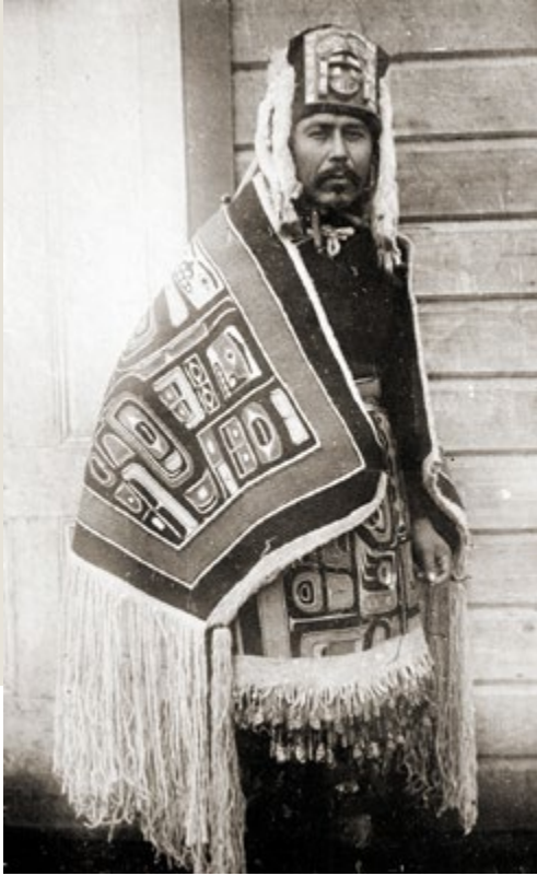
Nisga'a chief in feast robe, 1902. Accession no. 2675

With the formation of the Government of Canada, the ways of life for all First Nations were changed forever. The government developed policies that forced a system of “band” governance on First Nations so that they could no longer use their own system of government. A band is a community of First Nations people whose membership is defined by the Government of Canada. Many bands now have an elected council, called a “Band Council,” and an elected chief . Traditionally, some First Nations leadership was hereditary, and was passed down through the generations. Today many First Nations still have systems of hereditary leadership. Some bands continue to recognize their Hereditary Chief in their Band Councils, in addition to their elected Chief, but others do not. 4 Today band councils are responsible for administering the education, band schools, housing, water and sewer systems, roads, and other community businesses and services for their First Nations members. 5 There are 203 First Nations bands in BC, 6 and 614 in Canada. 7