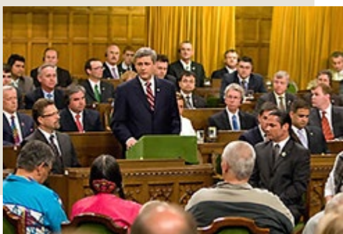
Prime Minister Harper offers full apology on behalf of Canadians for the Indian Residential Schools system, 2008.