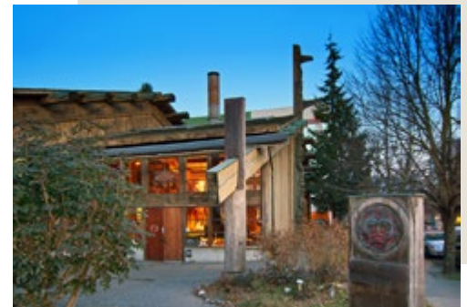
NEC Native Education College: BC's largest private Aboriginal college.

Community partners hosted 12 cultural exchange visits. First Nations, Aboriginal, and immigrant community members visited different sites as guests. For example, the Musqueam and Tsleil-Waututh Nations each hosted a visit. For many participants, this was their first time in a First Nations community. There were visits with the Ismaili, Jewish, and Chinese communities, and the Vancouver Aboriginal Friendship Centre, Native Education College, and the UBC First Nations Longhouse and Museum of Anthropology also welcomed guests. In these exchanges, hosts shared their knowledge of their communities and invited participants to see special places and join in activities.