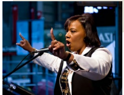
Dr. Bernice King's Keynote Speech, September 22, 2013.