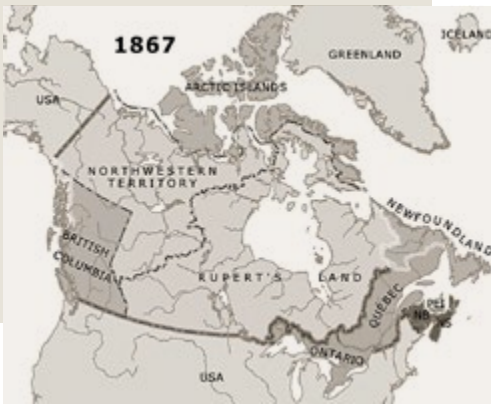
Map of the Dominion of Canada in 1867.

In the early 20 th century, there was a rapid increase in poverty on reserves. Reserves were isolated and marginalized in the larger Canadian economy. Canadian laws made it illegal for Aboriginal people to use their traditional means of resource distribution, and limited their ability to fish and hunt. 16 It also made it illegal for them to pursue redress in court.