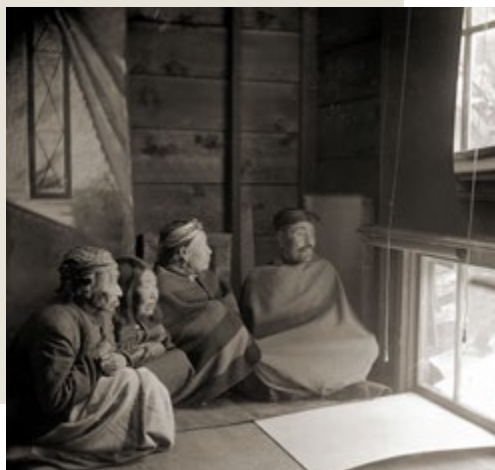
Group of four Kwakwaka'wakw elders, seated, clothed in blankets, c. 1900s. Accession no. 71740

People repeat stories orally to keep information alive over generations. 8 Particular people within each First Nation have memorized oral histories with great care for accuracy. 9 While everyone knew some history, not everyone was a historian. 10