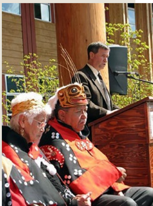
10 th Anniversary celebration of the Nisga’a Final Agreement, 2010.

Tsawwassen means “land facing the sea.” The Tsawwassen First Nation is located on the Strait of Georgia near the Tsawwassen ferry terminal,