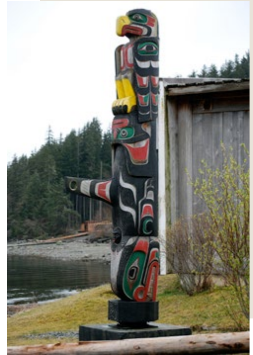
Totem pole at Alert Bay.

A potlatch is a formal ceremony used by First Nations on the northwest Coast of North America. The Potlatch is the essence of the culture as it is the cultural, political, economic, and educational heart of the nation. A potlatch may be held to recognize and celebrate births, marriages, deaths, settle disputes, totem pole raising, giving cultural names, passing on names, songs, dances, or other responsibilities, or formalizing aspects of relations between families or communities. 14 Potlatches are large events that can last several days. They often include two important aspects: the host giving away gifts and the recording, in oral history, of the events and arrangements included in the ceremony. Potlatches are also a way to redistribute wealth as