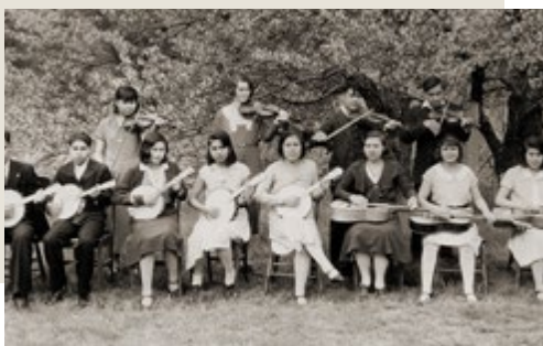
Alberni IRS orchestra, c. 1930.

The majority of Indian Residential School students experienced neglect and abuse at the schools. They suffered the disconnection from their home families, communities, languages, and cultures. Many children were physically, mentally and sexually abused. Some committed suicide. Some died trying to escape. 3