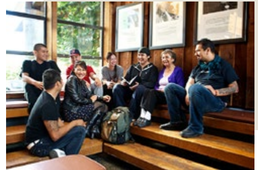
Students speaking with an Elder in the fireplace lounge of the NEC Native Education College.

“The Aboriginal Friendship Centre means a lot to me because I have so many different friends here now. I get really lonely sitting at home all by myself. People from all different places come here. They’ve got Métis people, Cree people, and people from all up and down the coast. It just seemed like I fit right in and I started doing everything that I’m doing right now...”