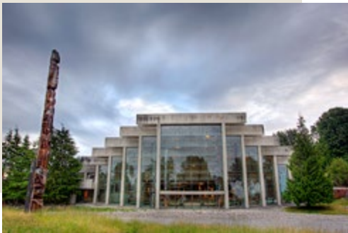
Gulf of Georgia Cannery.