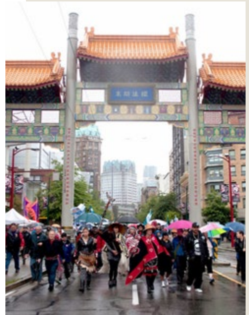
Walk for Reconciliation, September 22, 2013.