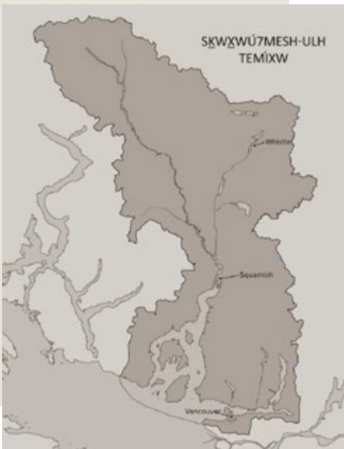
Map of Squamish Territory. Created by OldManRivers for Wikimedia. Released under CC-by-2.0

The Squamish Thunderbird symbol represents a bird watching over the people. The wings are watching over the sea creatures. Its crest is male and female. The tail feathers represent the past, present, and future.