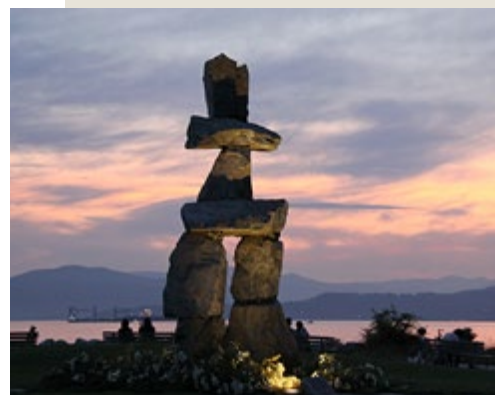
Inukshuk at English Bay in Vancouver. Photo by Christina Chan. Released under CC BY 4.0.