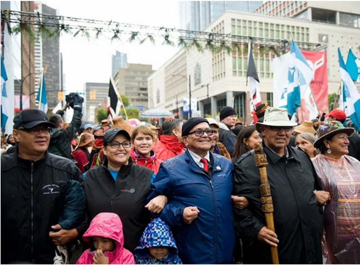
Walk for Reconciliation, September 22, 2013.