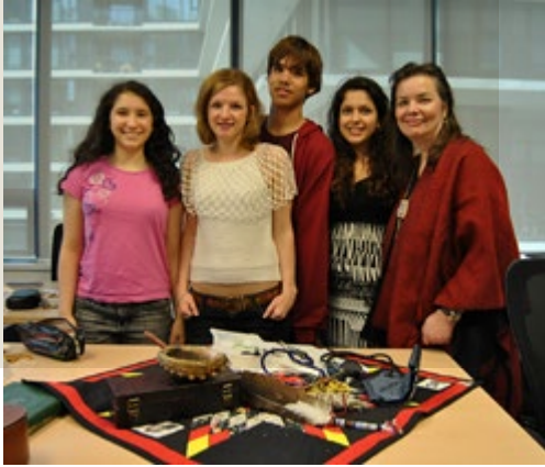
Youth and Elders PhotoVoice project group.